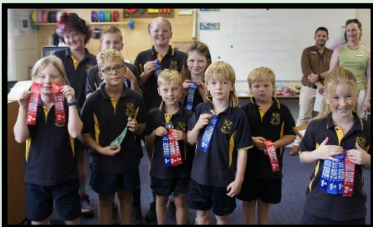
Cowra Small Schools Carnival