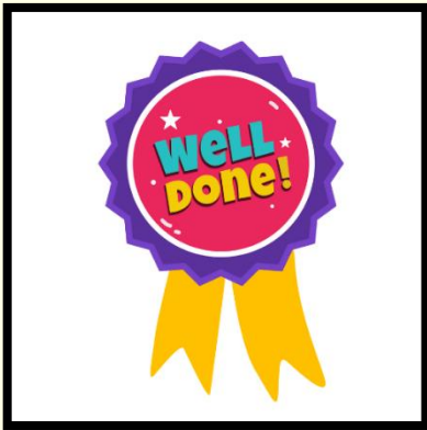
Infants – Chase Hodge